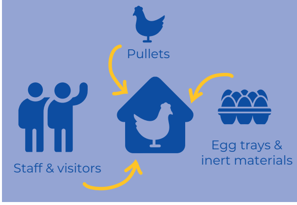
Figure 2: Biosecurity pictogram