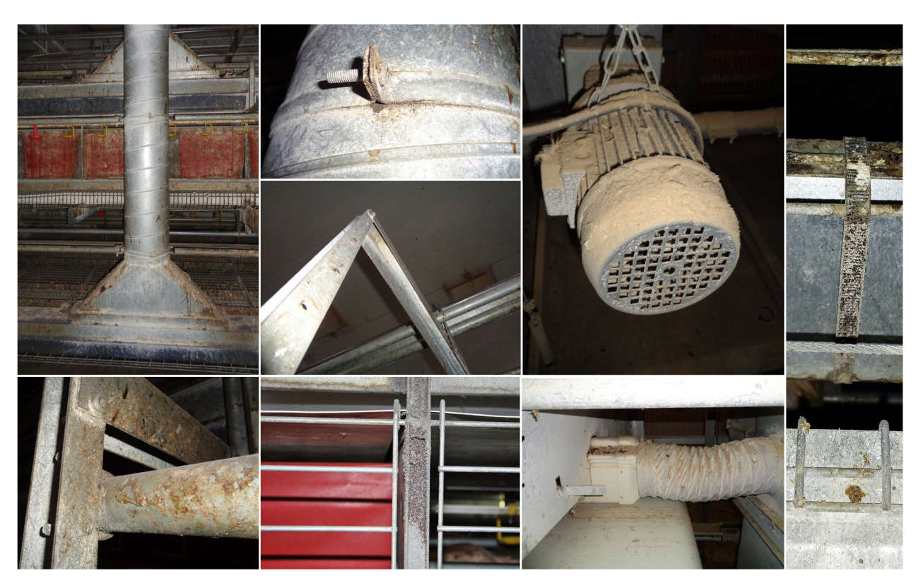
Figure 4: Examples of areas that require thorough cleaning such as manure belt aeration system, motors, tubing, joins, support structures, cable tie