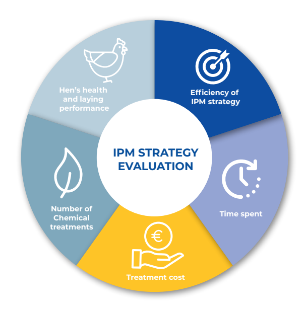
Figure 9: Indicators to take into account for the evaluation of the IPM strategy

cautiously and only as a last resort in cases where despite all former actions, either: