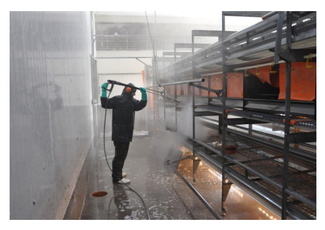
Figure 5: Wet cleaning of aviary housing system

Wet clean the house (Figure 5), equipment and wintergarden with high pressure, preferably hot water) and soap/detergent. Make sure the inside of ventilation ducts, manure belts and egg belts are cleaned thoroughly. Let everything dry and disinfect afterwards