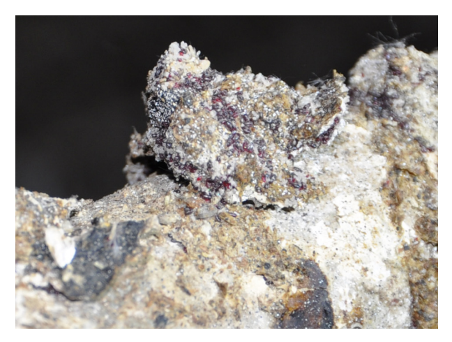
Figure 3: Red mites on manure