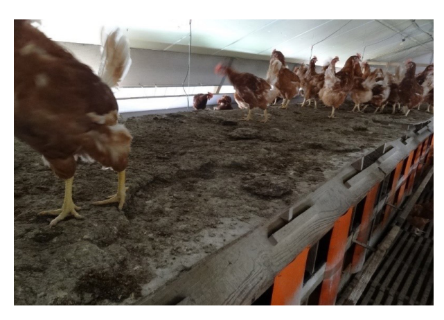
Figure 6: Hard manure crusts need to be removed

scraped from the house at least monthly (Figure 6)