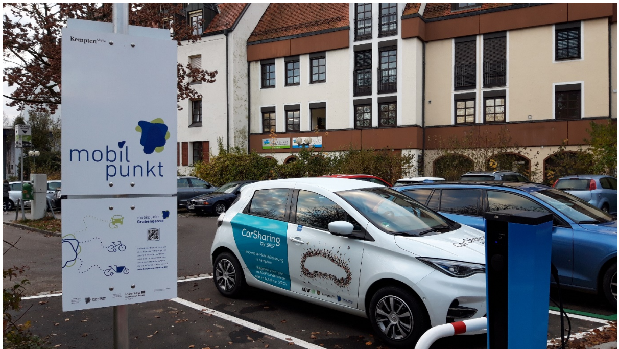
Picture 3: First implemented hub with 2 e-cars (one is in use) and the sign.

For now we have three operational hubs, two located close to the city centre and one at the vicinity of the centre. One is at the "bike box" as stated above which is also equipped with to e-cars. The other two have two cargo bikes each. The cars started the service in October 2020 and the cargo bikes where running from September 2021 and December 2022. Besides the charging facilities there is a sign at every station with the name and a short description (see pic 3). The additional four stations will be deployed by the end of April.