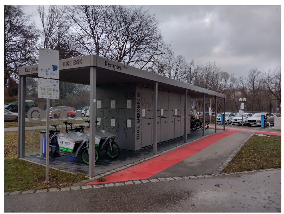
Picture 5: mobility station with 2 e-cargo bikes (foreground) and 2 e-cars (background).