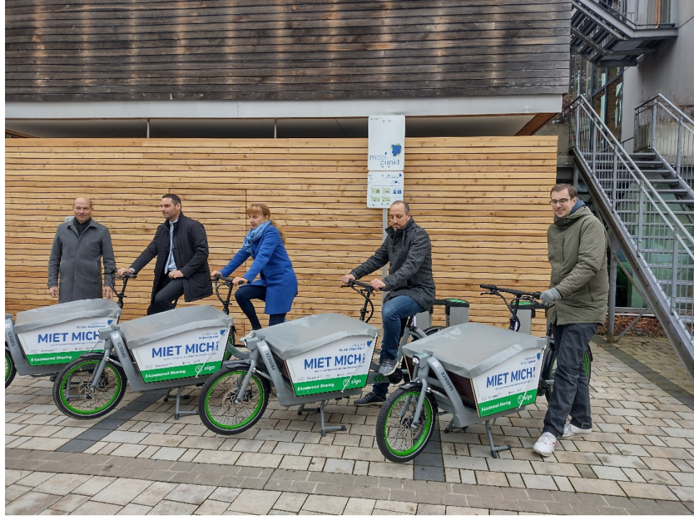
Picture 4 : second implemented mobility station with city mayor, representatives of housing associations and service provider (from left to right) posing with the cargo bikes.