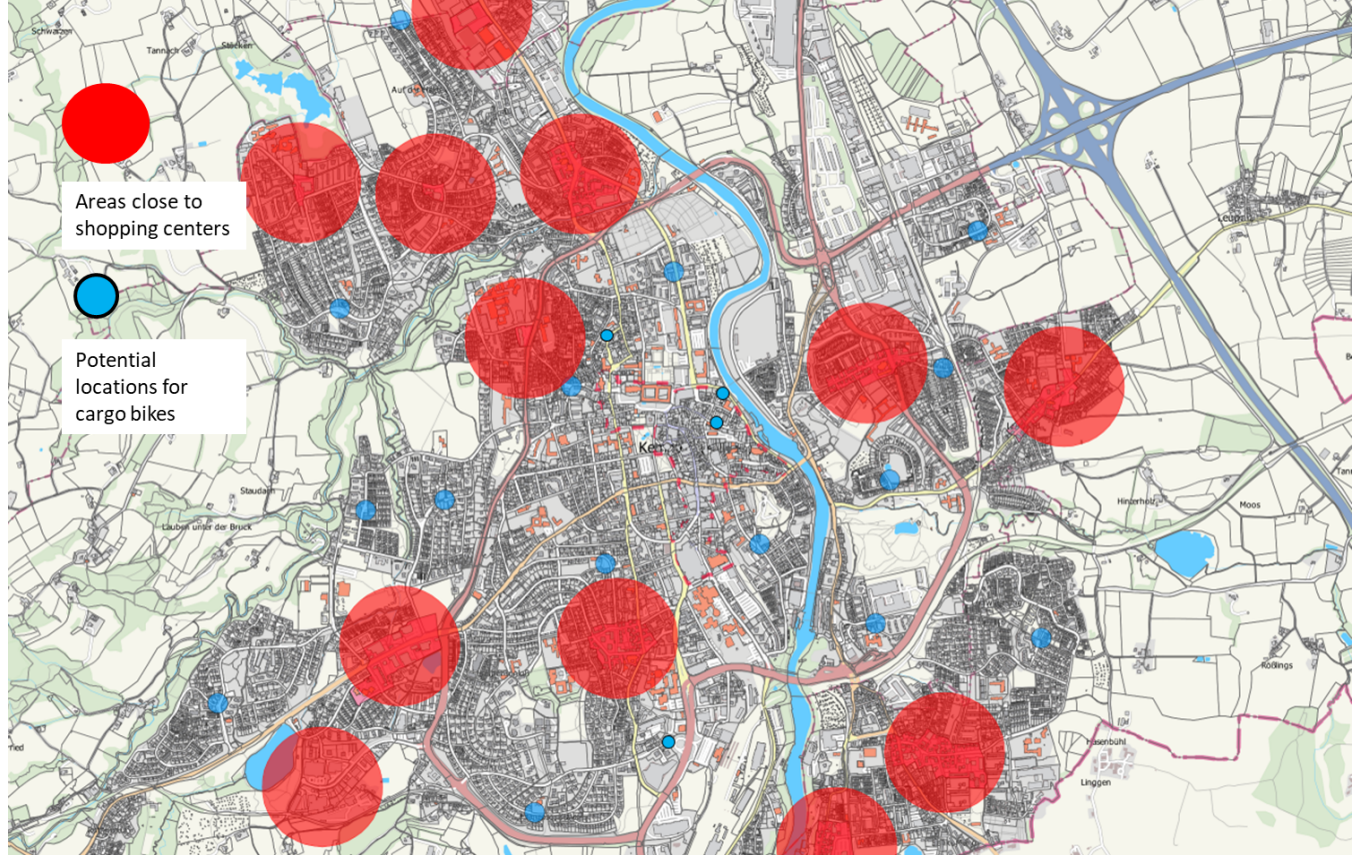
Picture 1: Map of Kempten with local shopping centres and their catchment areas (red circles) and possible locations for mobility stations (blue circles).

In the following the specifications of the different locations will be detailed.