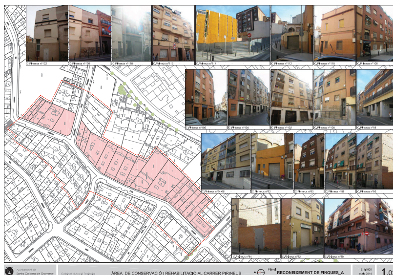
Buildings of Street of Pirineus before rehabilitation works.